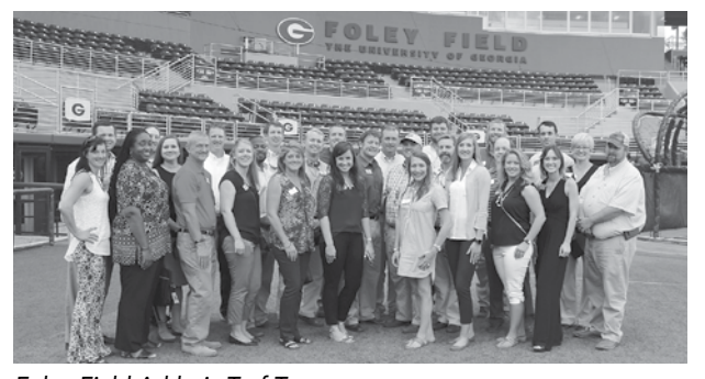
Foley Field Athletic Turf Tour.